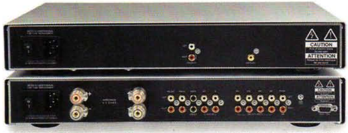
ABOVE: Simple unbalanced analogue and coaxial digital outputs on the CD player (top) are joined by four line inputs, a phono input and tape loop plus preamp output and a set of unswitched speaker outlets on the amp (below)

have decried such technology. No, it doesn't have the warmth of valves, nor the visceral presence of Class A tranny amps. Its lack of absolute transparency only becomes apparent when you feed the CD-30 into a different amplifier, as I found when playing it through the McIntosh C2200/MC2102 combination. But a slight graininess is not enough to condemn the amp, for it is so mild as to warrant no more concern than the shadings between consecutive grades of speaker cable from the same maker.